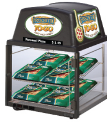
LARGE WARMING CABINET

Size: 13.25"W x 18.25"H x 12.25"D (7" Pizzas Only)