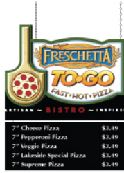
HANGING SIGN MENU BOARD