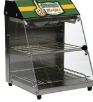
SMALL WARMING CABINET

Size: 13.25"W x 18.25"H x 12.25"D (7" Pizzas Only)